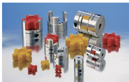
Jaw coupling: best for shock absorption

Often times the negative affects will outweigh the positives and force the user to look for another type of coupling. In applications using smaller motors, a large percentage of the motor's torque is used to overcome the inertia of the coupling, seriously reducing the performance of the system.