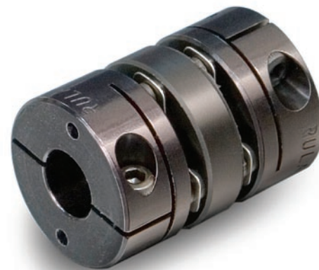
Disc coupling: torsionally rigid high misalignment capability

Jaw couplings are well balanced and are able to handle high rpm applications very well (manufacturers rate speeds up to 40,000+ rpm), but are not able to handle very large amounts of misalignment, especially axial motion. Large amounts of parallel and angular misalignment cause bearing loads that are higher than most other types of servo couplings. Another factor that the user must be aware of is the situation when a jaw coupling fails. If a spider fails, the coupling will not disengage. The jaws from the two hubs will mate similar to teeth on two gears and continue to transmit torque with metal to metal contact which, depending on the application, may be desirable, or could cause problems in the overall system where the coupling is installed. An advantage of the jaw coupling is the ability to mix and match spiders based on the application. Manufacturers of zero backlash jaw couplings offer multiple materials with different hardnesses and temperature capabilities that allow the user to choose exactly the insert that meets the application's performance criteria.