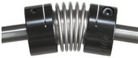
Bellows coupling: most rigid Torsionally