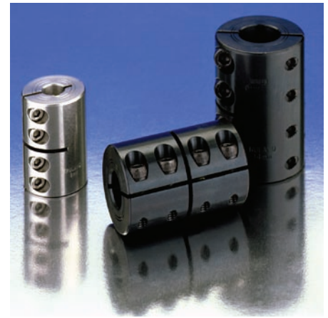
Rigid coupling very precise: requires no misalignment

Although in the past many people wouldn't consider using this type of coupling in a servo application, recently smaller sized rigid couplings, especially in aluminum, are increasingly being used in motion control applications due to their high torque capacity, stiffness, and zero backlash.