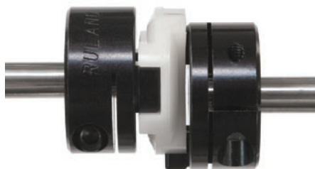
Oldham coupling: high parallel misalignment capability

Choosing the most appropriate type of coupling to use in servo applications can be confusing. This article examines the pros and cons of the various technologies.